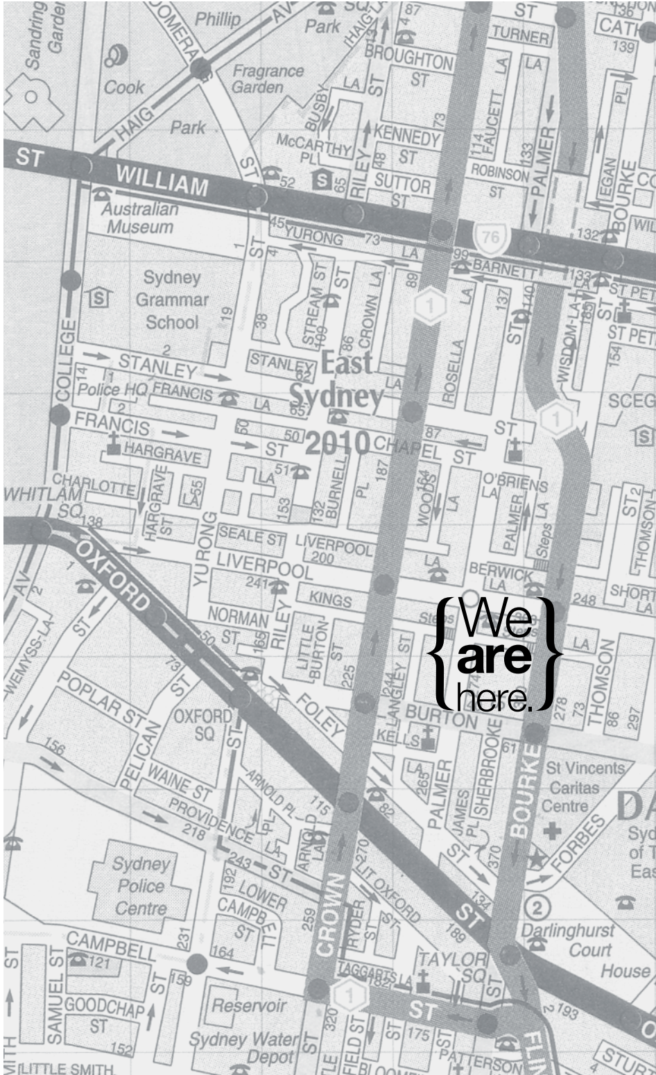
Map of East Sydney.